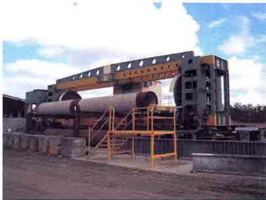
Hydrostatic Pressure Tester