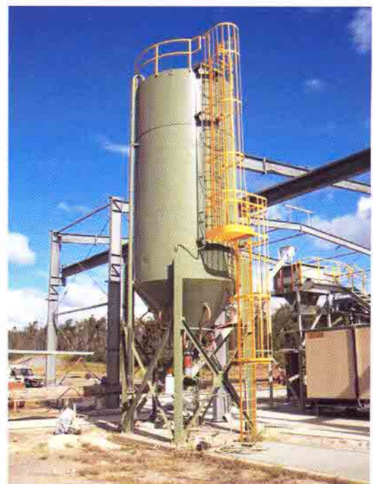
Cement Mortar Lining Plant